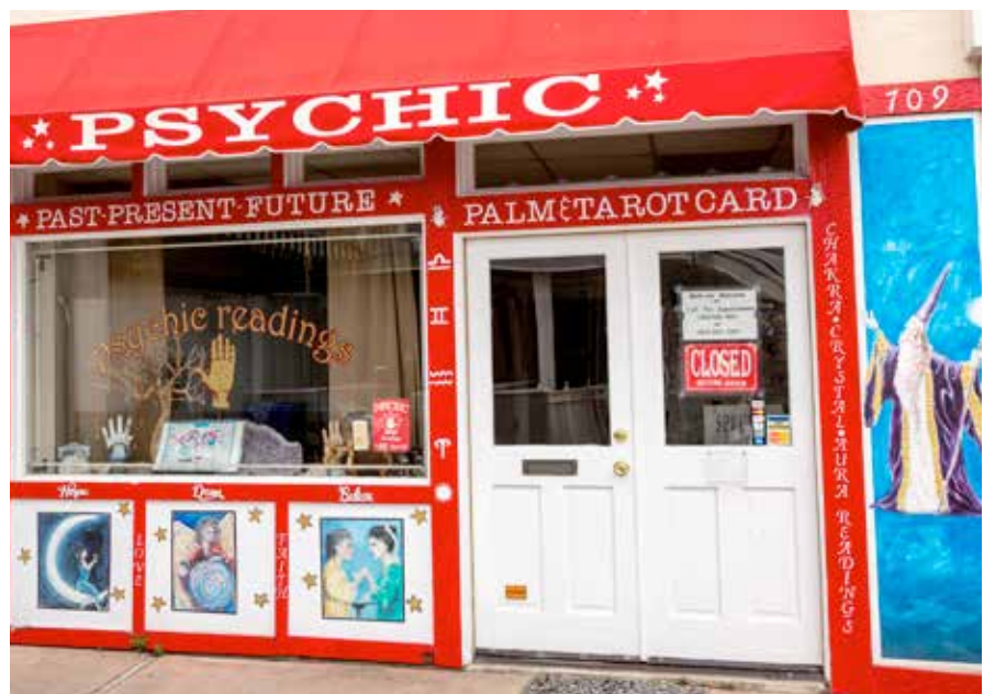
Common in most cities, psychics claim to use various mediums —cards, crystals, spirits, etc.— to gain hidden personal insights.

“For rebellion is as the sin of witchcraft, and stubbornness is as iniquity and idolatry. Because thou hast rejected the word of the LORD, He hath also rejected thee from