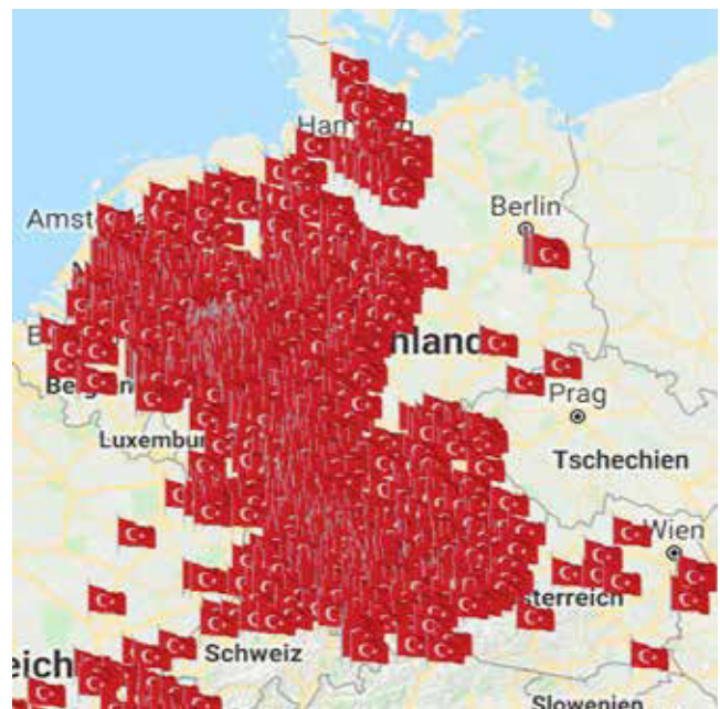
User assembled map of mosques in Germany derived from results found on Google Maps.

According to the EU Financial Transparency System 2014-2019, €5,139,569 went to Islamic Relief, another Muslim Brotherhood front group. German officials have accused Islamic Relief Worldwide of “significant” connections to the underground Muslim Brotherhood. “A submission