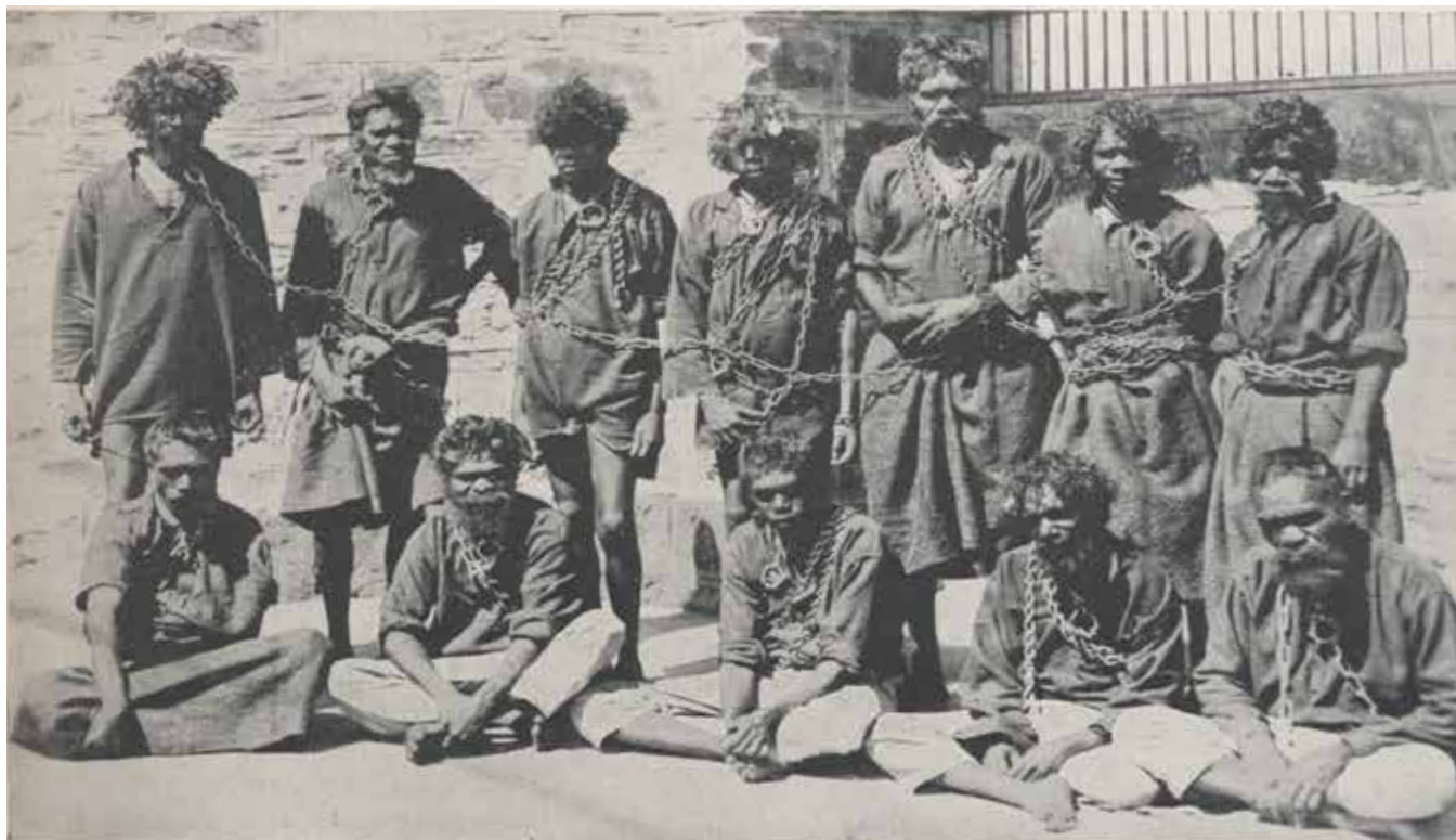
West Australian Native Prisoners

Which race do you think was placed in the top spot? Aryans. To a modern reader the term conjures an instant association with Nazi Germany, and rightly so. On such account it has since ceased to be used, just as a great deal of "science" regarding race was cast aside following World War II. They dropped it so quickly you would think they felt guilty or something... Famous author H.G. Wells' Outline of History uses it extensively, and applies it to more groups of people than you might assume. There are many repugnant ideas propounded in this work, but it is interesting in that it seeks to represent the scientific consensus of its day. Much of what it proposes on evolution