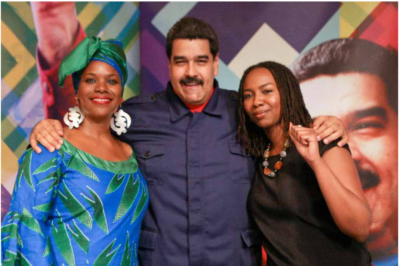
Patrisse Cullors (L) and Opal Tometi (R) on either side of Venezuelan dictator Nicolas Maduro in 2016.

In December 2015 Black Lives Matter sent a delegation, headed by the organization's co-founder, Opal Tometi, to act as observers during the Venezuelan Parliamentary elections of that year.