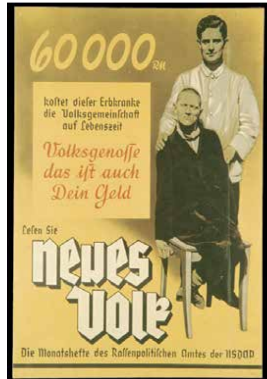
Propaganda for Nazi Germany's T-4 Euthanasia Program: "This person suffering from hereditary defects costs the community 60,000 Reichsmark during his lifetime. Fellow German, that is your money, too."

We are one family. Mankind was created in the image of God. What color Adam and Eve were is really inconsequential. All the variations of race, all the potentials of pigment and feature contained in our first parents that have become dominant through separation, adaptation, and yes, through inbreeding could be wiped out in a very few generations and we would all be the col-