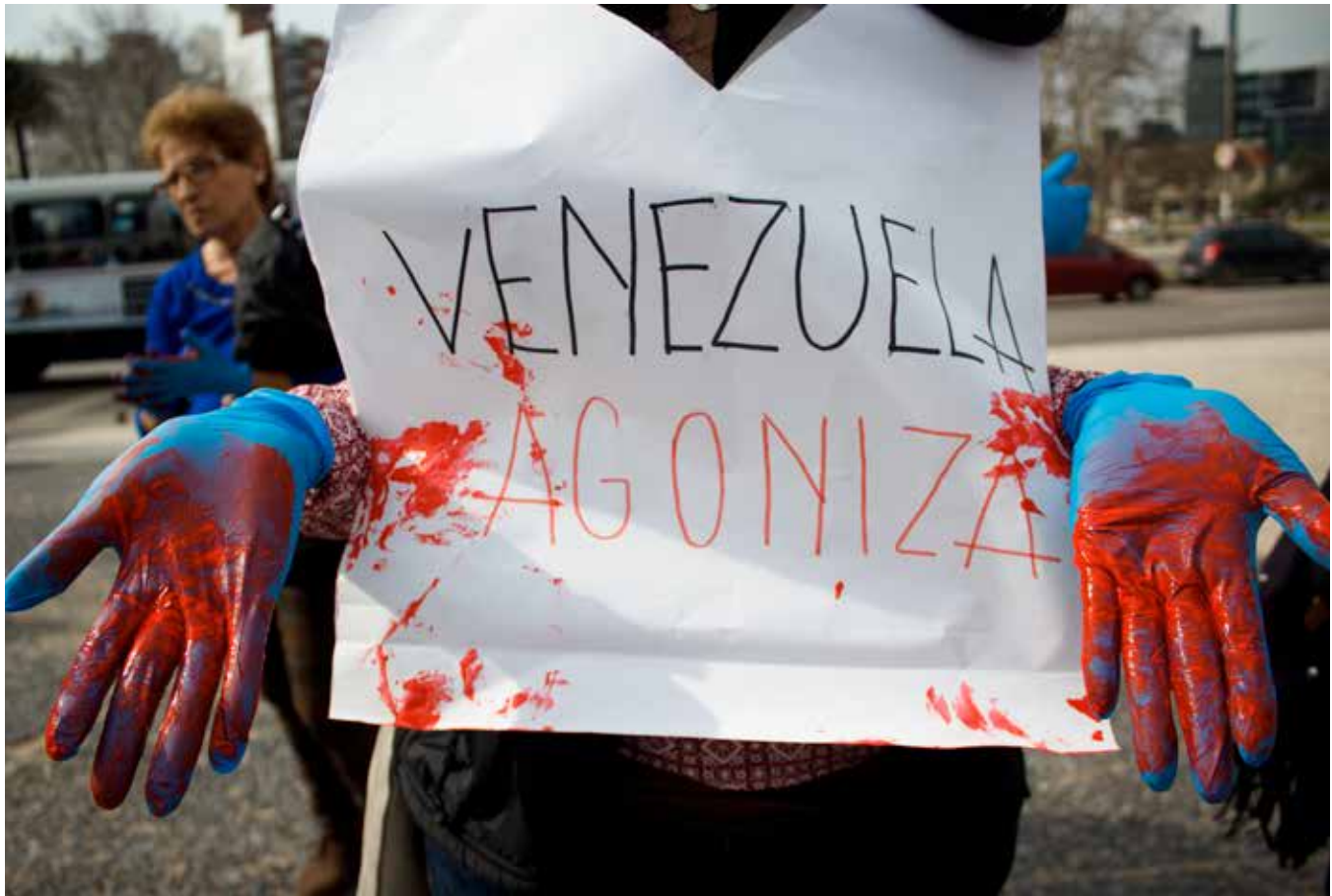
Venezuela has seen year after year of unrest. The sign above reads, “Venezuela Agonizes.”

The Maduro regime did not allow accreditation for observers from the Organization of American States, the UN, or the EU. The only accredited observers were from regimes and organizations friendly to the “revolutionary cause.”