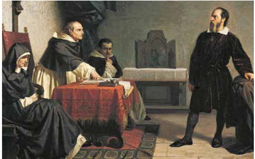
Galileo Facing the Roman Inquisition, Cristiano Banti, 1857.

Wisdom and knowledge are not the same thing. Vanity and pride have a way of subtly infecting our reasoning. Pure intentions can quickly become vested interests. Galileo's theory that the earth revolved around the sun was deemed heresy by the Catholic Church and he was forced to recant. But why? Does a heliocentric solar system really contradict the truth of God or just the dogma of that time? Rather than display any of the humility or meekness taught by our Lord Jesus Christ, who they claimed to worship, they clung haughtily to their