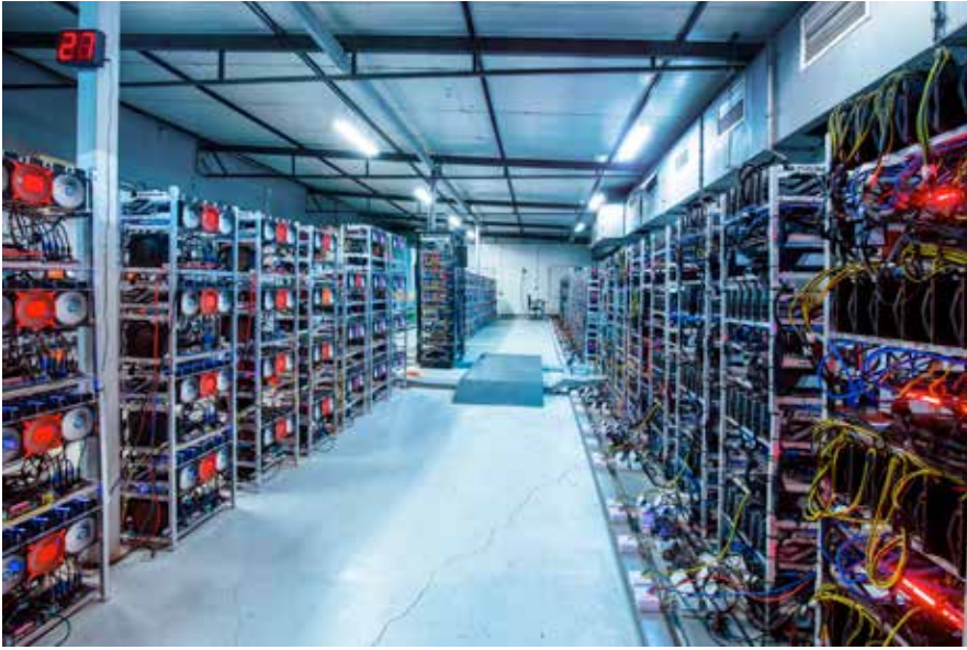
Inside a large Bitcoin/cyrpto mining operation. Hundreds of computers work nonstop, contributing to the mining of new Bitcoins and verifying the entire blockchain every ten minutes.

ods were extremely safe, access times were not measured in milliseconds, but often in hours, days — sometimes even longer!