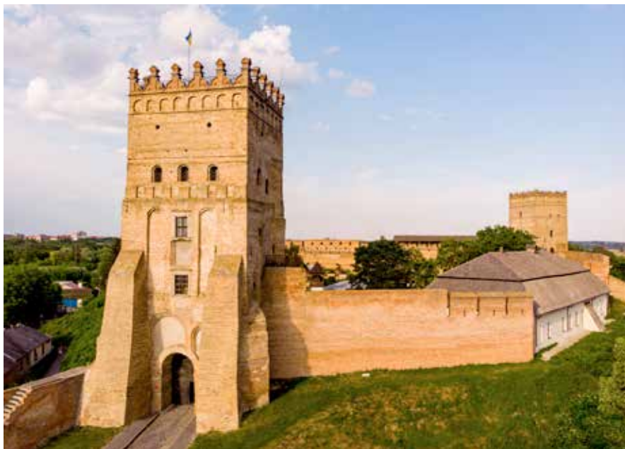
Lubart's Castle, or Lutsk Castle, built in the 14th century, was named for the last ruler of united Galicia-Volhynia, Liubartas.