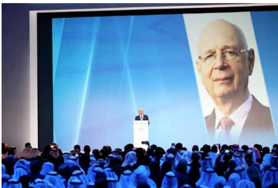
Klaus Schwab, WEF founder and chairman, delivers a speech at the 2023 World Government Summit in Dubai.

The other major leader of the Forum is George Soros. Soros also has a potentially troubling Fascist