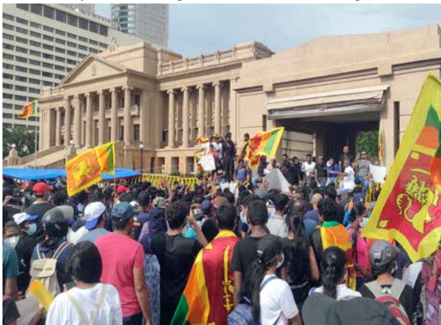
Conditions in Sri Lanka deteriorated until angry mobs overran the government in 2022. The economic crisis is still ongoing.

If you haven't heard a Trump speech lately, it'll do you good. Now he claims to know who is who, something he clearly didn't in his first term. The bigwigs in power now can't let him come back, so they've charged him with crimes. Not that they didn't before, but the guys who prosecuted those supposed misdeeds have slipped into obscurity. Now they've got new guys, no doubt with great reputations and accomplishments, to fall on their swords. After, that is, they've got the images they so desperately want, circulated at just the right time. Now they can't afford to miss. The country might be saved, and that's not on the agenda. □