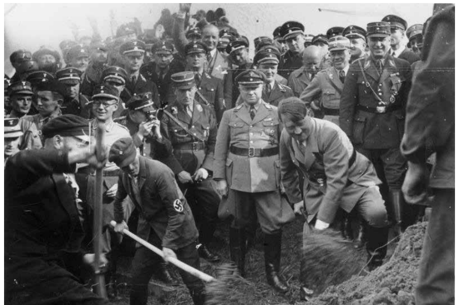
Hitler at a groundbreaking for a new section of highway. The Nazi Party greatly increased social programs, resorting even to slave labor for the benefit of the state.

2 Thessalonians 3:10, “For even when we were with you, we commanded you this: If anyone will not work, neither shall he eat.” (NKJV)