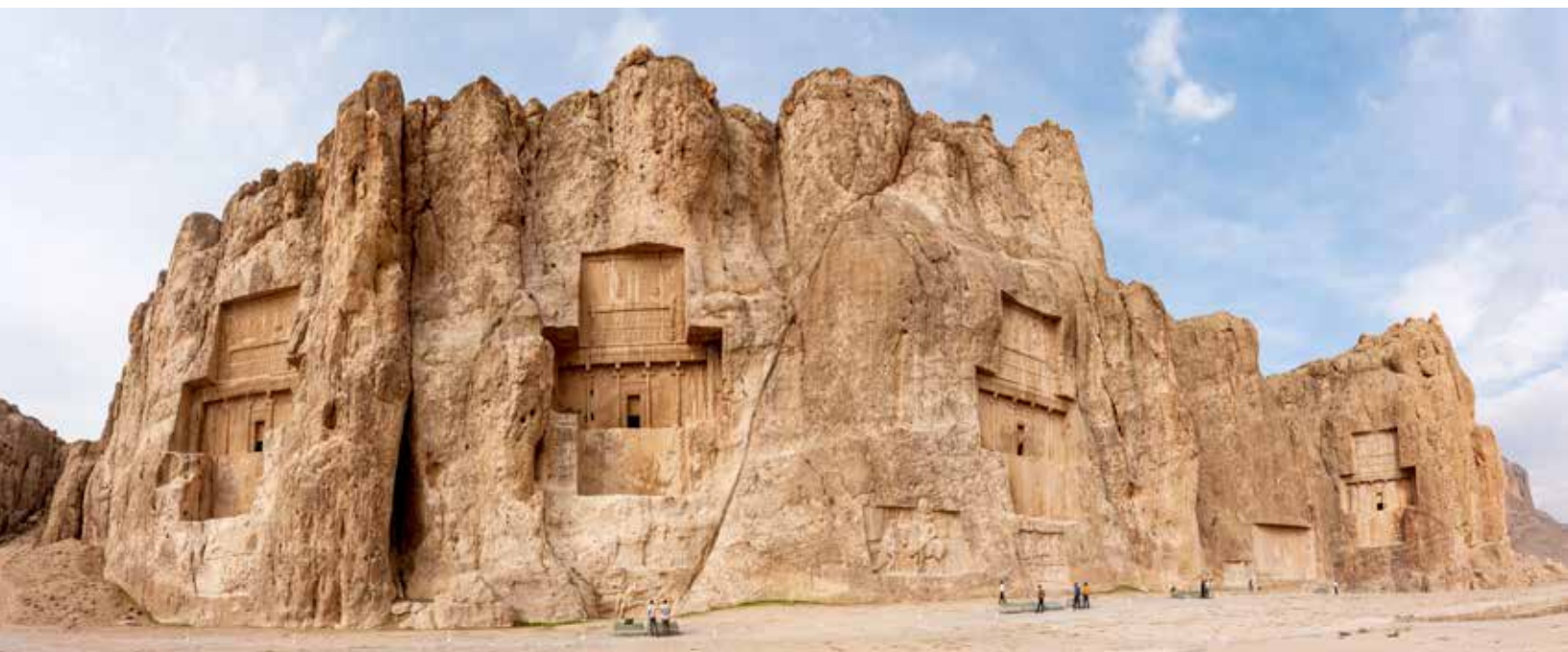
Naqsh-e Rostam, a mausoleum of Achaemenid Persian kings located near Shiraz, Iran. From left to right, tombs of Darius II, Artaxerxes I, Darius the Great, Xerxes I.

According to Herodotus, the Persian tribes were: the Pasargadae,