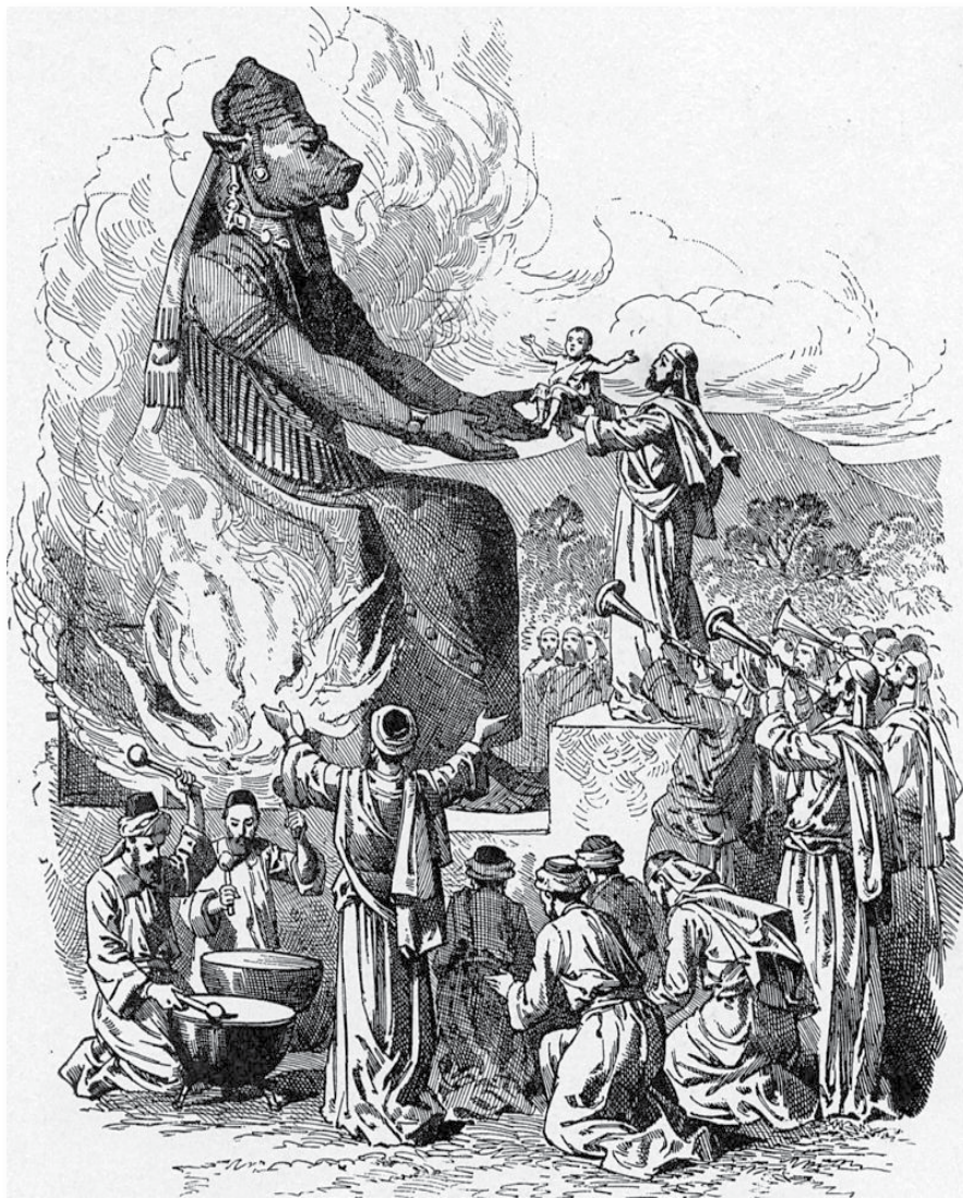
Depiction of ritual child sacrifice to the pagan god Molech.

But true to men's form, it was during the Achaemenid period that Zoroastrianism reached Southwestern Iran, where it came to be accepted by the rulers and became a defining element of Persian culture. The religion was not only accompanied by a formalization of the concepts and divinities of the traditional Iranian pantheon but also introduced several novel ideas, including that of free will. Under the patronage of the Achaemenid kings, and by 5th century BC as the de facto religion of the state,