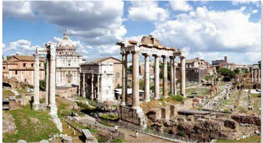
The Roman Forum. These are the remains of those buildings that during most of the Ancient Rome’s time represented the political, legal, religious and economical center of the city.

People eventually lost confidence in the government’s ability to solve problems. Citizens lost confidence in the government of Rome and maybe Americans are losing confidence in Congress and our media, the fourth branch of government. In the past, the Roman Senate had provided superb guidance for Rome during the struggle with Hannibal and