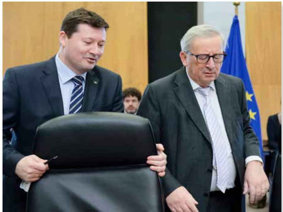
Secretary-General of the Commission, German, Martin Selmayr (L) and EU Commission President Jean-Claude Juncker at the start of a college meeting of the European commission in Brussels, Belgium, 27 February 2019.

He has played the system like a virtuoso violinist and in the process has created many enemies as