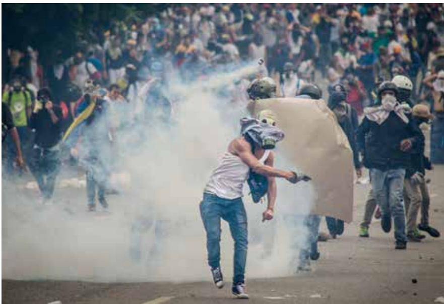
Caracas, Venezuela - Protester throws tear gas can that was fired by the national guard during protests against Maduro's government.

Venezuela is experiencing every kind of anarchy. There may not be calculators able to keep up with an inflation rate soaring into the millions of percent annually. We remember the wheelbarrows of paper currency it took to buy a loaf of bread in post-WWI Germany. Inflation in Venezuela is such that no wheelbarrow could carry enough currency to buy a loaf of bread. The currency is worthless. People are fleeing in the hundreds of thousands. Downtown Caracas is swarming with starving and angry citizens who want the scalp of their Socialist leader.