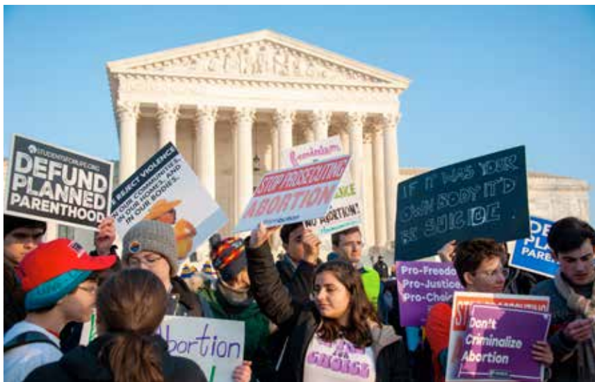
Opposing protestors at the March for Life in Washington, DC.

“To take the lives of these babies in the womb breaks my heart. It is not good for us and is not good for America,” he argued. “America is a nation that was founded on virtuous people. You know, our freedom is built on our virtue. You know, [Alexis] de Tocqueville when he came to view America and study Americans, said ‘why is