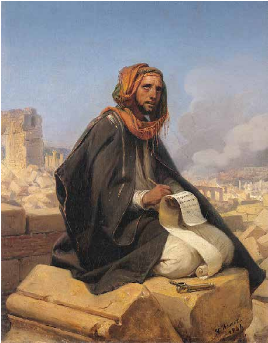
Jeremiah On the Ruins of Jerusalem, by Horace Vernet, 1844.

“Then the word of the Eternal came to Jeremiah, after that the king had burned the roll, and the words which Baruch wrote at