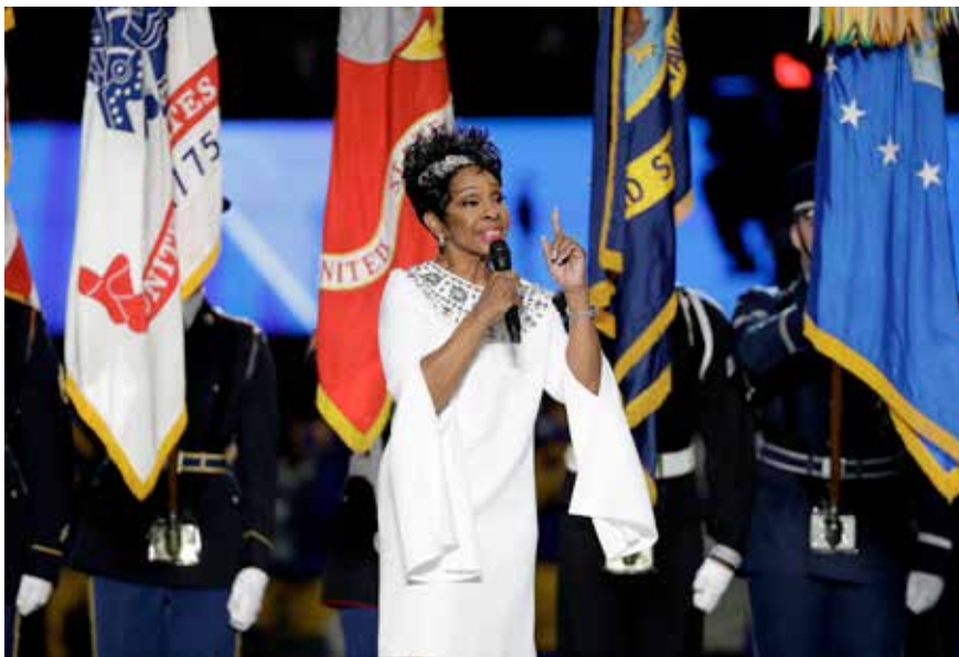
Seven-time Grammy winner Gladys Knight received heavy backlash for agreeing to sing "racist" National Anthem at the Super Bowl. Responding to critics she stated, "I pray that this National Anthem will bring us all together in a way never before witnessed..."

After all this time, and after we've seen the litany of revelations that confirm what we've known for over a year now, there is still hope that someday while we yet draw breath the FAKE NEWS crowd will finally have to admit their folly. But we're not holding our breath. □