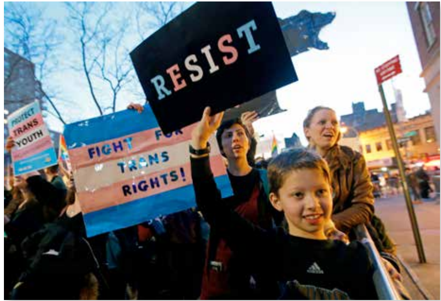
A "transgender" child and "his" mothers hold signs during a rally in support of transgender youth at the Stonewall National Monument, in New York.

The mother (and doctors at GENECIS), are waiting until the six-year-old boy's eighth birthday so they can chemically castrate