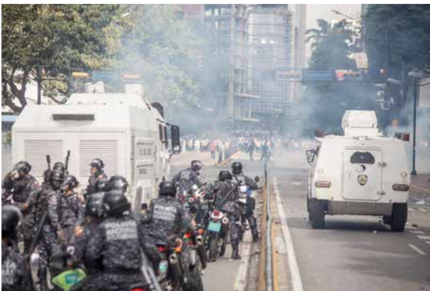
Demonstrations against the corrupt Maduro government and altercations with police have become commonplace in Venezuela.

Mainstream society hates and scoffs at everything we hold dear, especially our belief in God and His laws. We’ll see who gets straightened out in the end. □