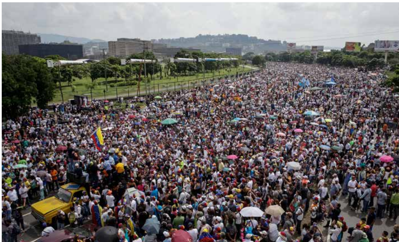
Hundreds of Venezuelans in several parts of the country began to gathered for the protest called 'Venezuela is against the dictatorship' to demonstrate against the government of Nicolas Maduro.

While the world's premier example of modern socialism, Venezuela, is in utter and complete collapse, economically, socially and politically, the news can barely be found. The mainstream just isn't interested, you'll have to look for it. Especially while CNN has the exclusive video of the swat-style raid on the home of another Trump confidant. "The walls are closing