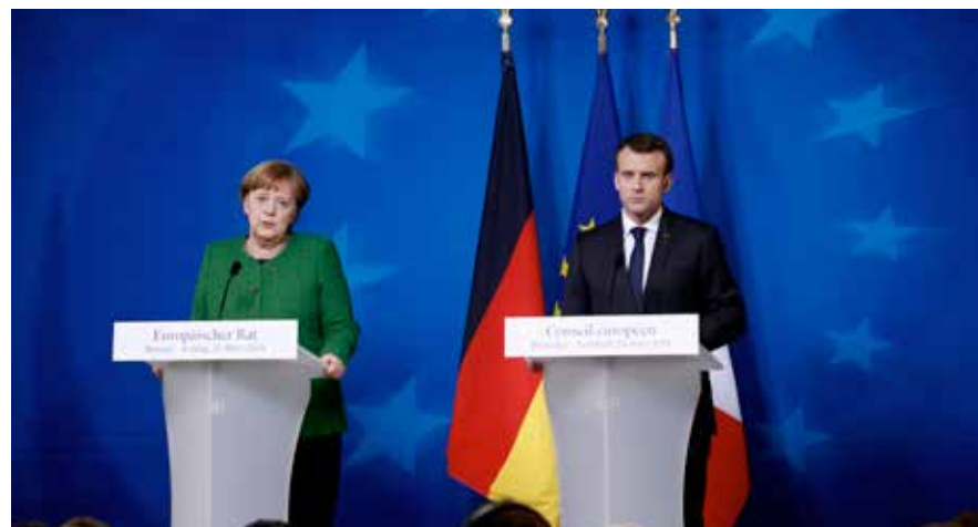
German Chancellor Angela Merkel and French President Emmanuel Macron at an EU leaders summit, March 2018.

between the U. S. and primarily European allies. Sure enough, the Europeans began worrying aloud within moments of the announcement of the cancellation. They, both national and EU leaders, are reportedly working to come up with something that President