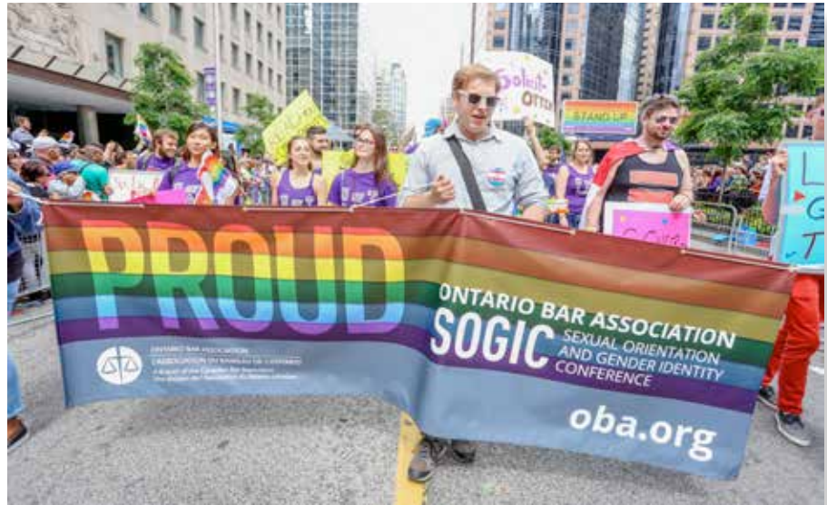
The Ontario Bar Association represents 17,000 lawyers, judges, notaries, law teachers and law students from across the province.

She continued, “LGBT activist lawyers have served three subpoenas on the Center for Military Readiness as a ‘non-party’ in the litigation. They are demanding the right to search through private emails from the first day of the Trump presidential campaign, to the present, and beyond. It appears that they are trying to prove what amounts to a conspiracy theory. In their minds, President Trump did not announce a change