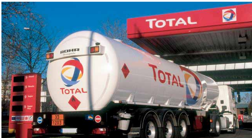
French energy company Total has a lucrative contract with Iran.

Relations have been dicey since the president assumed office. Our president embodies every uncouth American stereotype of the traditional European view. For Trump to cancel an agreement that promised massive profits, against the wishes of European leaders and diplomats, is being treated as the ultimate insult. It may well contribute to a “wedge” that leads to lasting acrimony between Europe and the United States. □