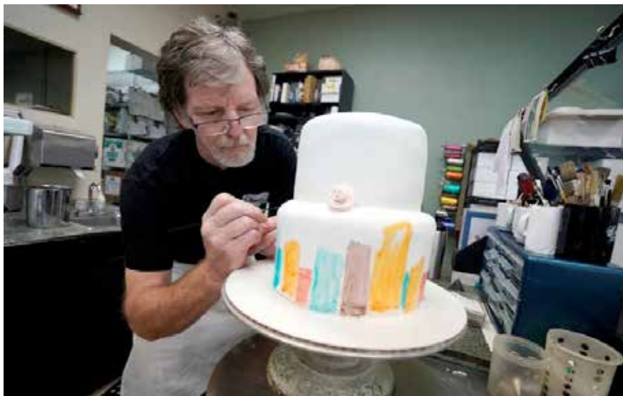
The US Supreme Court recently ruled in favor of the Colorado baker who refused to bake a cake for a same-sex wedding.