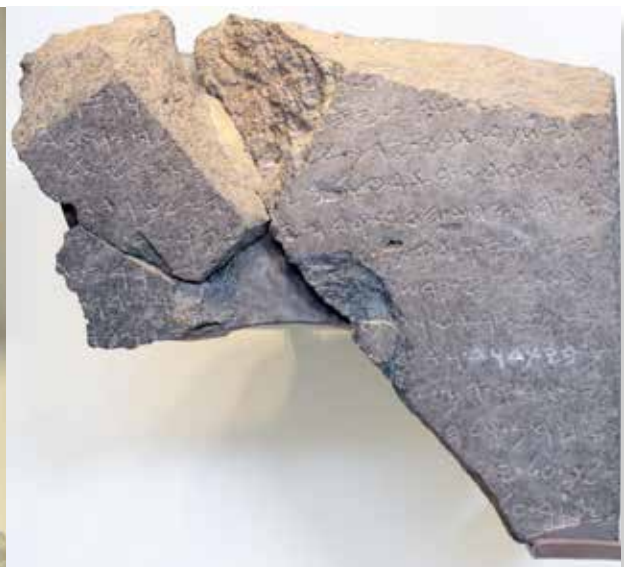
Left: The inscription on the Nabonidus cylinder mentions both King Nabonidus and his son Belshazaar. Right: Tel Dan Stele tells of a conflict which involved the “King of Israel” and the “House of David.”