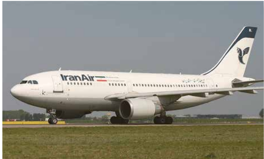
France’s Airbus plans to build over a hundred airplanes for Iran.

European nations and corporations that continue to trade with Iran face the prospect of running afoul of renewed U. S. sanctions. Simply stated, they may have to risk business relations with the