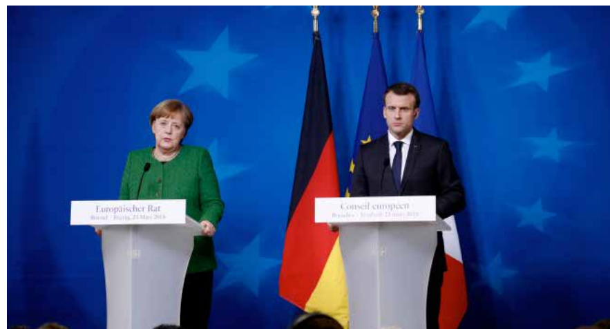
German Chancellor Angela Merkel and French President Emmanuel Macron at an EU leaders summit, March 2018.

between the U. S. and primarily European allies. Sure enough, the Europeans began worrying aloud within moments of the announcement of the cancellation. They, both national and EU leaders, are reportedly working to come up with something that President