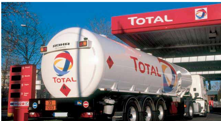
French energy company Total has a lucrative contract with Iran.

Relations have been dicey since the president assumed office. Our president embodies every uncouth American stereotype of the traditional European view. For Trump to cancel an agreement that promised massive profits, against the wishes of European leaders and diplomats, is being treated as the ultimate insult. It may well contribute to a “wedge” that leads to lasting acrimony between Europe and the United States. □