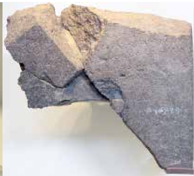
Left: The inscription on the Nabonidus cylinder mentions both King Nabonidus and his son Belshazaar. Right: Tel Dan Stele tells of a conflict which involved the “King of Israel” and the “House of David.”