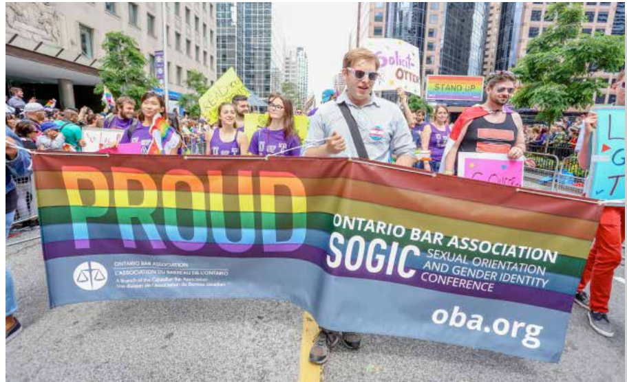
The Ontario Bar Association represents 17,000 lawyers, judges, notaries, law teachers and law students from across the province.

She continued, “LGBT activist lawyers have served three subpoenas on the Center for Military Readiness as a ‘non-party’ in the litigation. They are demanding the right to search through private emails from the first day of the Trump presidential campaign, to the present, and beyond. It appears that they are trying to prove what amounts to a conspiracy theory. In their minds, President Trump did not announce a change