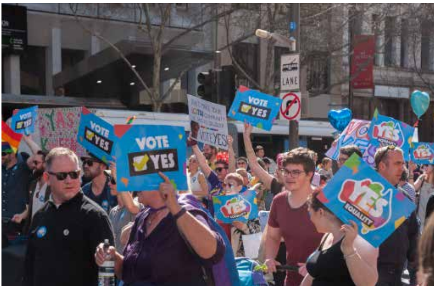
Adelaide, AU—September 16, 2017: Over 5,000 supporters of “Marriage Equality” gather at the South Australian Parliament House for the largest Equal Rights rally held in Adelaide.

“Yes.” Homosexuality was decriminalized across Australia decades ago. Over the years homosexual rights have been legislated at both the State and Commonwealth level with equal rights legislation across the gamut involving same sex partner rights in superannuation law, inheritance law, leave entitlements, carer entitlements, adoption rights, fostering rights, even legally