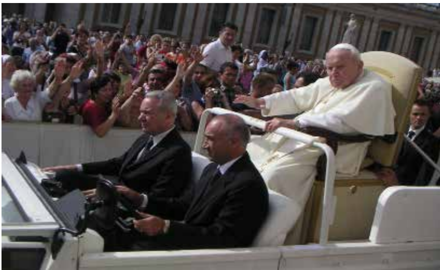
“A mortal plague... it is called Islam.” – John Paul II.

The stakes are highest in Europe, particularly Germany. Bible prophecy indicates that an evil entity will ultimately prevail and enforce beliefs and behaviors upon all mankind. It’s what the “global warming” zealots, the “gay” marriage crowd, and those that demand open-borders and mass amnesty crave above all else: An enforcement mechanism. □