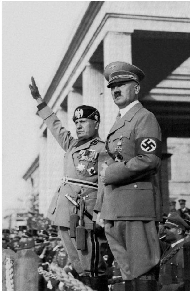
Mussolini and Hitler. Oct. 25, 1936, an Axis was declared between Italy and Germany.

the bogey men of the Communist Party to stir up support. The Fascists claimed that Communists were about to take over Italy. In a preemptive strike, they would march and congregate into greater and greater numbers as they closed in on Rome. If the Fascists were not given power, they would take it.