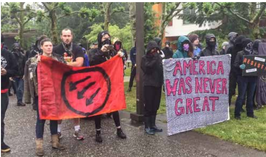
Protesters “fighting Fascism,” while espousing Fascist ideology.

Mussolini was a charismatic speaker. He became a socialist leader and editor of several Socialist publications. He differed from other Socialists in that he openly supported direct violence to achieve political goals. Violence,