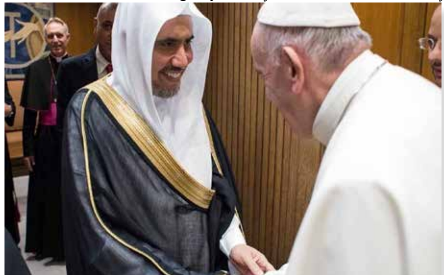
Pope Francis welcomes to the Vatican the head of a Muslim group tied to the financing of jihad terror.

If time travel could be arranged and Pope Francis could run into Callixtus III, Callixtus could "expect a punch," for Francis is not just a defender of Islam, but a defender of the Sharia death penalty for blasphemy: after Islamic jihadists murdered the Charlie Hebdo cartoonists who had drawn Muhammad, Francis obliquely justified the murders by saying that "it is true that you must not react violently,