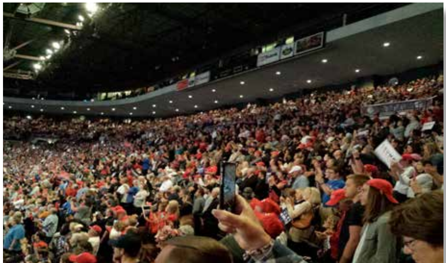
Partial view of the crowd attending a Trump rally in the U.S. Bank Arena, Cincinnati, Ohio on October 13, 2016.

history. The world's largest economy, an unusually high standard of living, personal freedom with civil rights protected by the rule of law, and an unrivaled military capability has rendered Her premier among the nations. Contributions to science and medi-