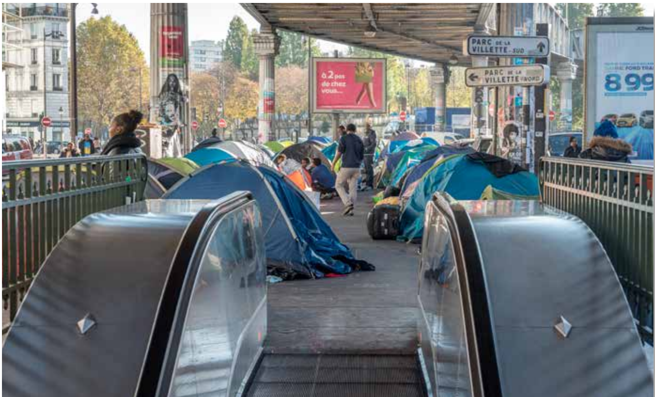
Paris, FRANCE - OCTOBER 31, 2016 : Urban migrant camp in northeastern Paris near the Stalingrad subway station.

1 — Because the number of migrants is huge. The 2015 United Nations World Population Prospects report states: "Between 2015 and 2050, total births in the group of high-income countries are projected to exceed deaths