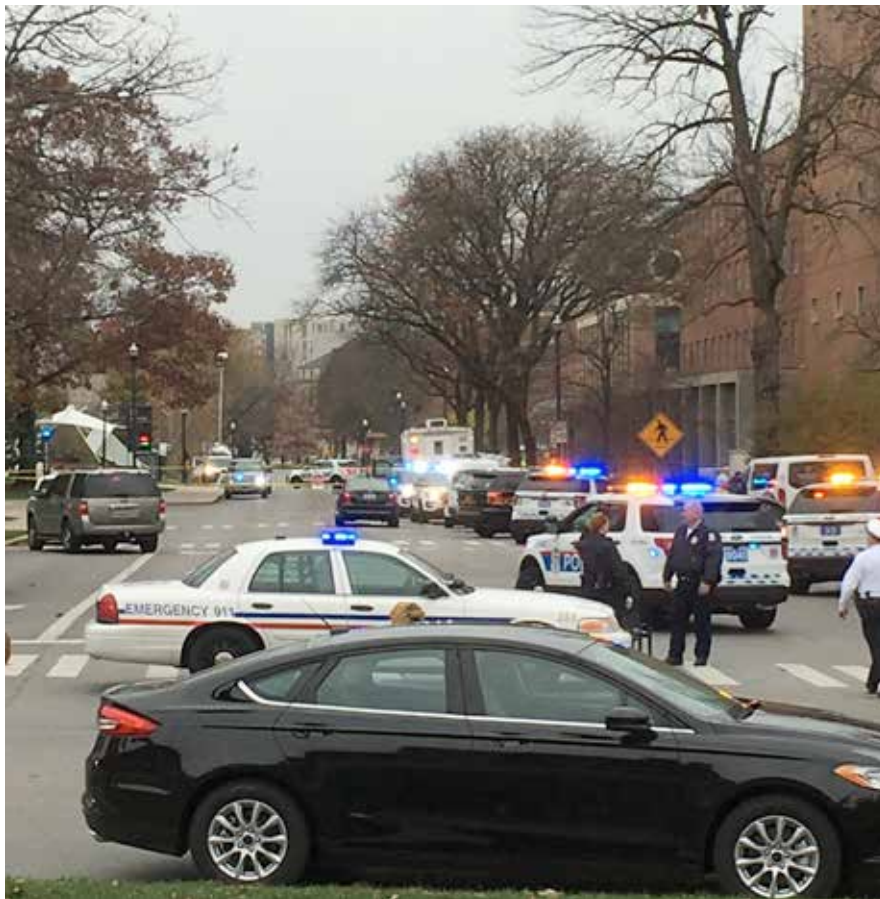
Police respond to attack at Ohio State University.

They want a confession to all the imagined slights, malicious thoughts and unconscious bias that characterize white American citizens, and they're not about to stop demanding it. It's beginning to look as though they may just be disappointed, again. □