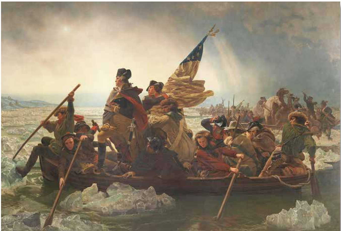
Washington Crossing the Delaware, December 25, 1776, by Emanuel Leutze, 1851.

too rowdy and unbiblical. Washington knew that the British, and especially Hessian soldiers, would be drunk or hungover after their Christmas celebrations. He crossed the frozen Delaware River, surprised the enemy and won an easy victory. This same victory turned public opinion back toward the Revolution, thereby gaining support as well as much needed volunteers and supplies. The Christmas victory at Trenton, New Jersey was a vital key to American Independence. You could say that not keeping Christmas might have saved the American revolution! □