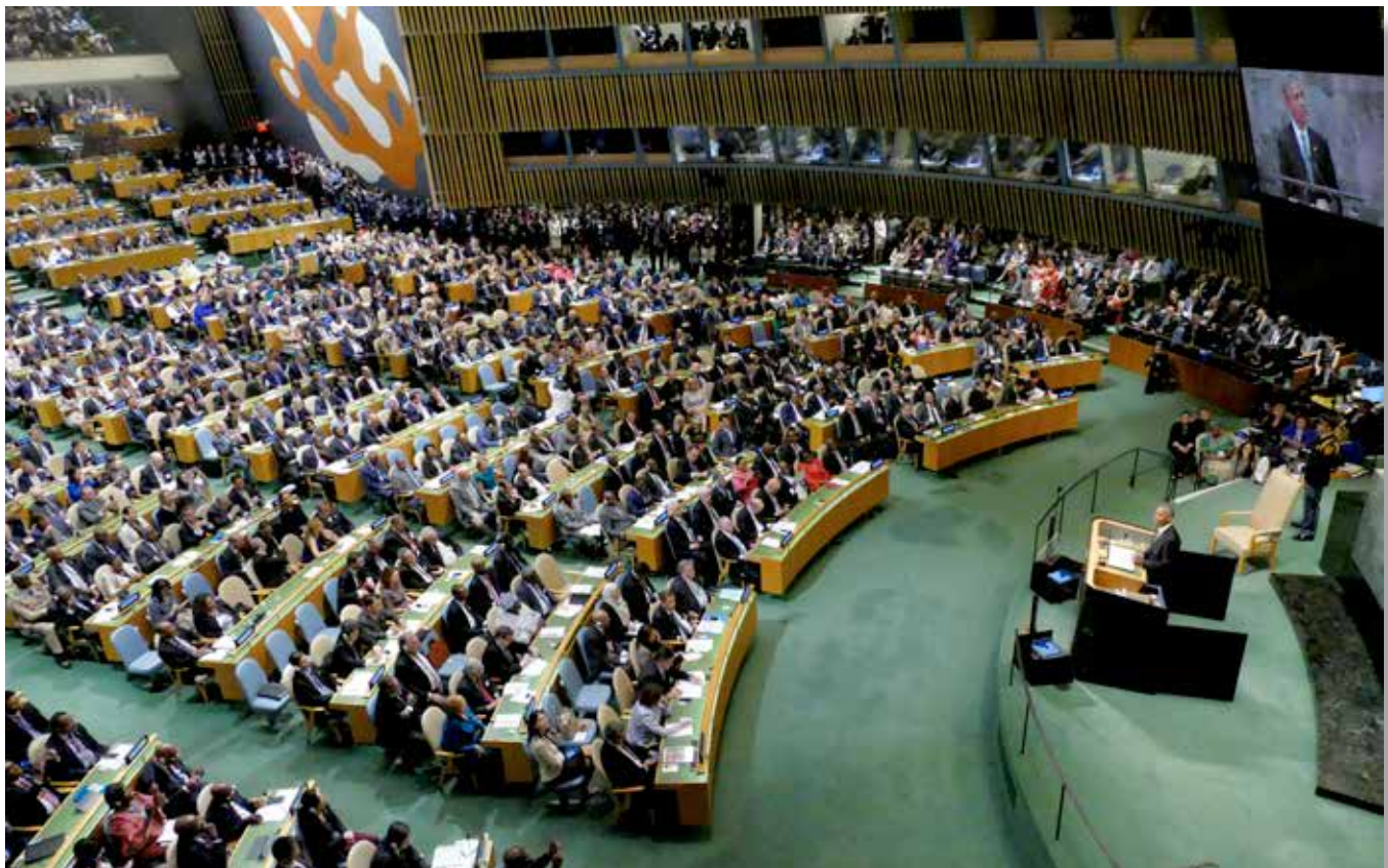
New York, United States. September 20th, 2016: United States President Barack Obama holds a speech at the General Debate of the 71st Session of the General Assembly of the United Nations.

Some of its greatest achievements? It has ousted the United States of America from its human rights commission, and put Libya and Cuba at the helm! It strove