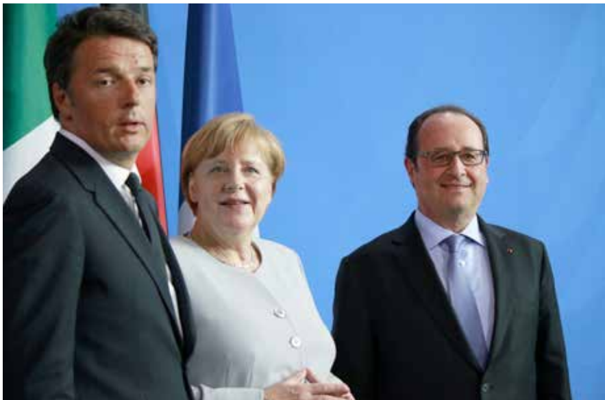
Italian Prime Minister Matteo Renzi, German Chancellor Angela Merkel and French President Francois Hollande.

Worrying about France's own elections next year, Valls expressed concern that electoral debate is "ignoring the danger posed by the far-right." The governing leadership of France is acutely concerned that Marine Le Pen, leader of the anti-EU, anti-immigration National Front may now have a shot of winning next year's election outright. He said, "We face a historic moment... perilous for the world, perilous for Europe and perilous for France." For her part, Marine Le Pen was quick to announce, "Congratulations to the new pres-