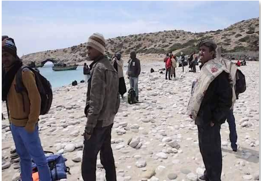
In April of this year, 140 illegal migrants landed on the Greek island of Gavdos (population 152).

Hungarian lawmakers on July 6 voted 151 to 41 in favor of building a 4-meter-high (13-foot) fence along the 175-kilometer (110-mile) border with Serbia. The measure aims to cut off the