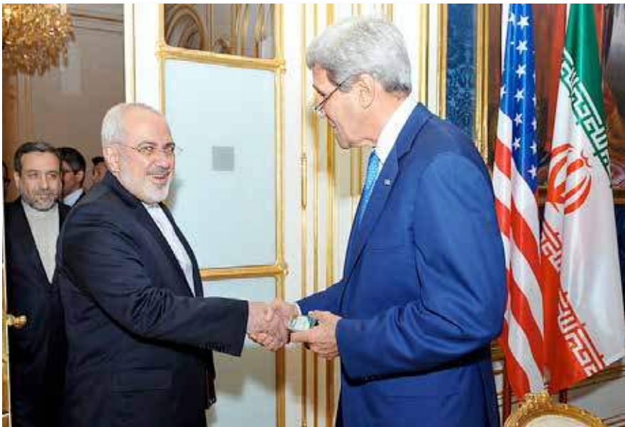
Secretary Kerry greets Iranian Foreign Minister Zarif.

But the transformational president of the United States knows better than the Israeli Prime Minister, and for that matter anyone with a smattering of knowledge about the criminal, radical terrorist regime in Iran. The only reason anyone can fathom for his stubborn insistence on making a nuclear agreement with this most dangerous of Middle East nations, is that this might be his last hope for some “legacy” relating to foreign policy. Everything else he’s touched in the Middle East has gone up in flames. And what a legacy this will be, if it cannot be quashed by Congress over the next couple