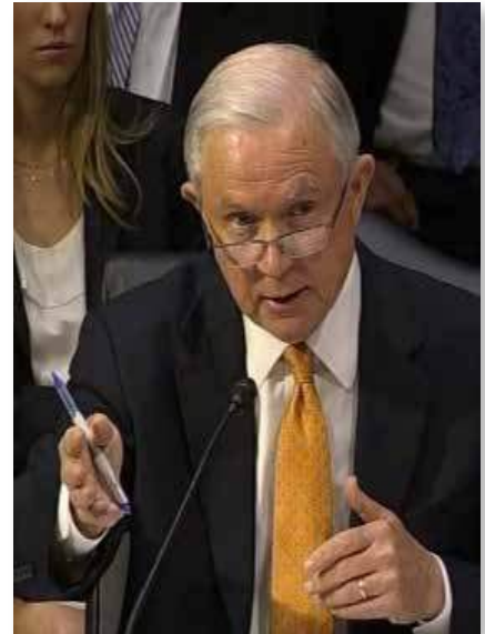
Sen. Jeff Sessions, R-Ala