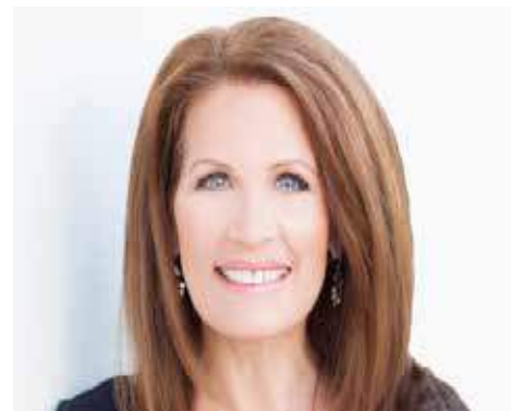
Former Rep. Michelle Bachmann, R-Minn.

“America is our country. It is time the politicians listen to