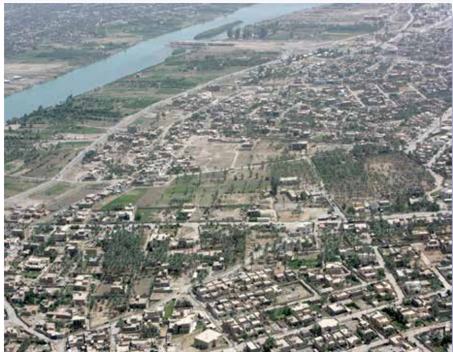
Euphrates River in Ramadi, Iraq.

They apparently have little choice but to repeat politically expedient talking points for the current administration, while ISIS zealots litter Ramadi streets