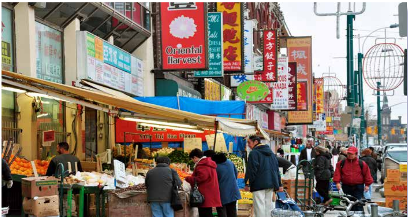
Chinatown in Toronto, Ontario.

Is there anything good about multiculturalism? Are there positive aspects brought about to a society or nation? Are there