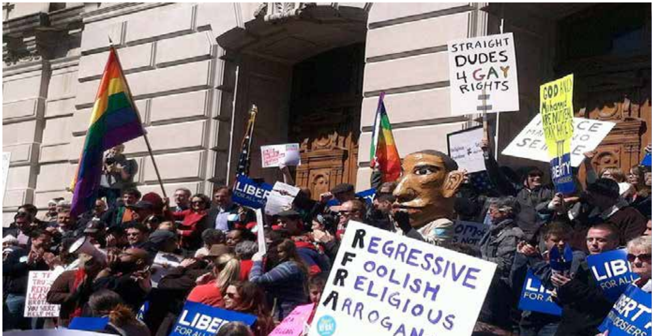
Crowds in Indiana protesting the Religious Freedom Referendum Act.

Now, rather than a legal issue, it is starting to look like economic blackmail. The message is, "Either get on