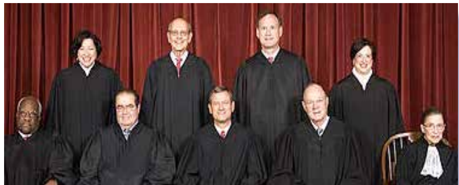
Supreme Court Justices of the United States

1993. It was signed into law without any national uproar of protest by Bill Clinton in 1994. A burning issue attributed to the need for such a law was that native Americans should have the right to possess or transport peyote for religious ceremonies, even though it is an illegal substance under State and Federal laws. At the time, no one had ever heard of "gay marriage."