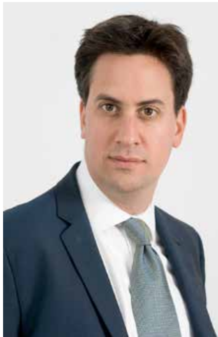
Ed Miliband, former Leader of Britain's Labour Party, lost big.

“We are going to make it [Islamophobia] an aggravated crime. We are going to make sure it is marked on people’s records with the police to make sure they root out Islamophobia as a hate crime.