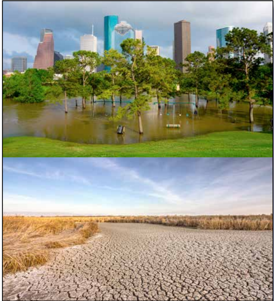
Severe flooding in Texas and extreme drought in California, both supposedly due to “Climate Change.”

Ironically, National Geographic’s sermon on settled science could have hardly come at a more inopportune time. In recent months, leading scientists have reversed themselves and have admitted their expert findings and advice were wrong on eating fat. After decades of telling us not to do so, we now learn that fat can be good for your diet and for weight loss. What we all thought to be true based on the expert testimonies, turned out to be precisely the opposite of the truth. Oops.