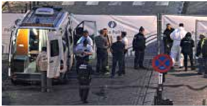
Police at the site of a shooting at the Jewish Museum in Brussels, Belgium, where four people were killed.

Studies suggest antisemitism may indeed be mounting. A 2012 survey by the EU’s Fundamental Rights agency of some 6,000 Jews in eight European countries – between them, home to 90% of Europe’s Jewish population – found 66% of respondents felt antisemitism in Europe was on the rise; 76% said antisemitism had increased in their country over the past five years. In the 12 months after the survey, nearly half said they worried about being verbally insulted or attacked in public because they were Jewish.