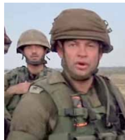
IDF Col. Ofer Winter

Ordman also noted religious texts, specifically the Jerusalem Talmud, teaches Israelis not to depend