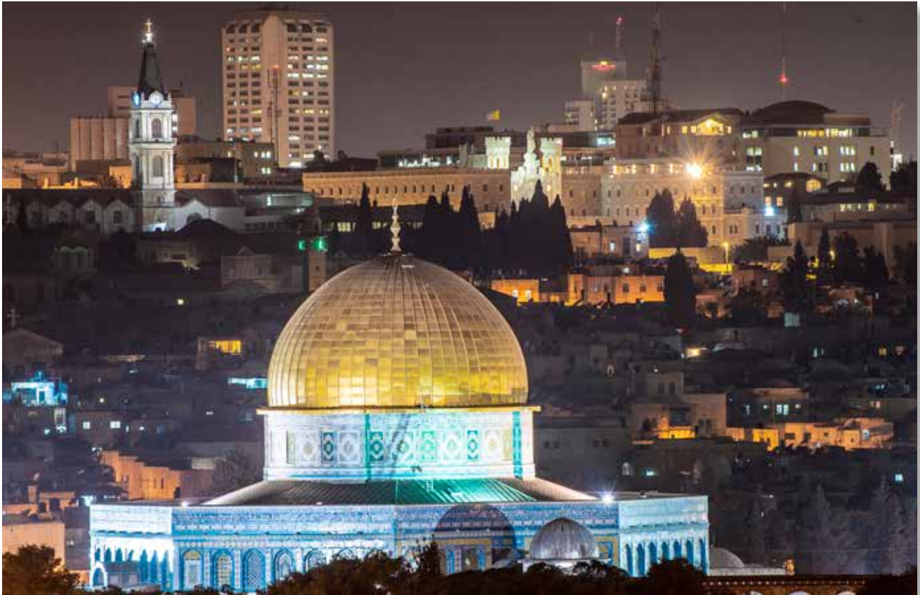
Dome of the Rock.

the environs of Jerusalem, the Sea of Galilee, and various other points up and down the land that is now called Israel, including portions of southern Lebanon or Syria.