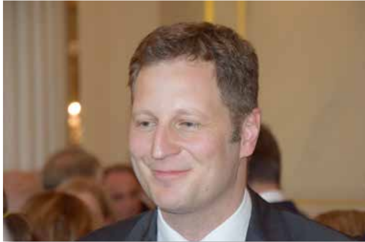
Georg Friedrich Prinz von Preussen

To enter Berlin's biggest building site the tall, rangy man puts on a blue hard hat and a high-visibility jacket emblazoned with Besucher – visitor. But the 38-year-old is no ordinary visitor; his liquid eyes and distinctive profile suggest as much. Here, in 1914, Kaiser Wilhelm II announced Germany's entry into the first World War. Exactly 100 years later,