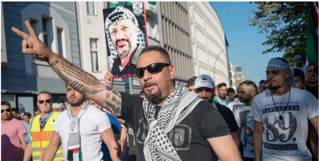
Openly Antisemitic Protester in Berlin on July 17th 2014. Around 1000 pro-palestinian people came together in Berlin to protest against a pro-Israeli rally on Joachimstaler Platz in Berlin. The Protest was dominated by anti-semitic shoutings. The Protester on the Photo made sure everybody could see his Nazi-Tattoos.