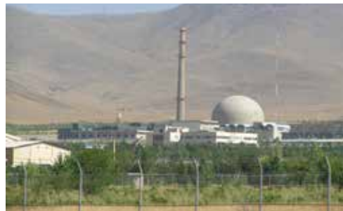
Arak Heavy Water4 - Nuclear program of Iran.

Iran is also widely known to be the primary supplier of rockets and missiles to Hamas in Gaza. It appears that Iran, with sanctions having been largely dropped and attention shifted first to the conflict in Israel then to ISIS, is at liberty to forge ahead with its nefarious nuclear work. We're going to hate the circumstances that bring the Iranian