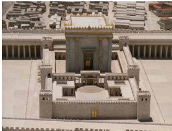
A model of the New Jerusalem.

Jews prior to these events, he could move into it. This would set the stage for the fulfillment of Christ's warnings: "Then let them which be in Judaea flee into the mountains: Let him which is on the housetop not come down to take anything out of his house: neither let him which is in the field return back to take his clothes...for then shall be great trib-