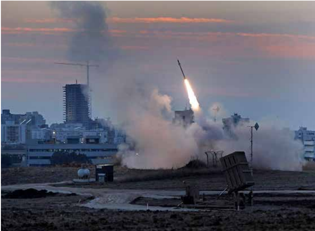
Israel's Iron Dome missile-defense system is fired to intercept enemy rockets

Operation Protective Edge as a religious war against non-Jews. The Israeli government's stated aim is to stop rocket attacks at Israel and destroy a network of tunnels dug under the border from Gaza used to launch terror attacks inside Israeli territory.