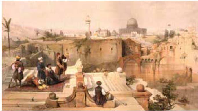
1840 jer salat / Public Domain/wikipedia.org. / David Roberts

The pivotal point of the ages-old struggle between Jews and Arabs is Jerusalem. The gilded “Dome of the Rock” and neighboring Al Aqsah