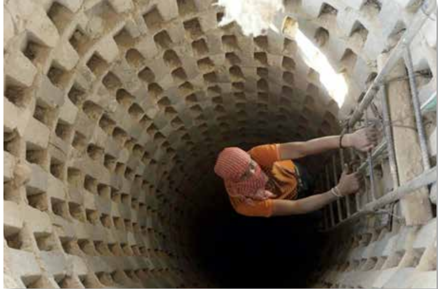
A Hamas operative climbing upward in a pier of one of the major tunnels. Notice the work on the sides of the tunnel.

Who supplied these quantities of material? Who planned what would be needed? How did Hamas acquire thousands of ampoules of tranquilizer, syringes and other, additional drugs to be used? These are far beyond the quantities and variety of what is needed by any civilian medical service.