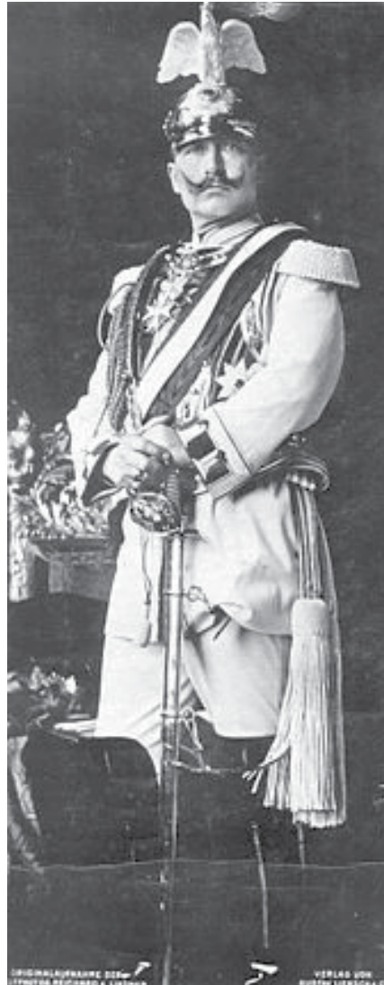
Kaiser Wilhelm II

Prussia's rise began in 1417 when the Hohenzollern dynasty bought the margravate, or principality, of Brandenburg. Wars and advantageous marriages helped the ambitious