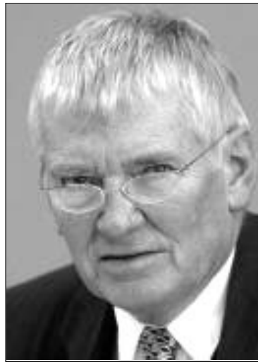
Herr Otto Schily, the Federal Minister of the Interior

What Herr Schily failed to say in his interview, is that liberal socialist immigration and welfare policies have had much to do with the creation of the current prob-