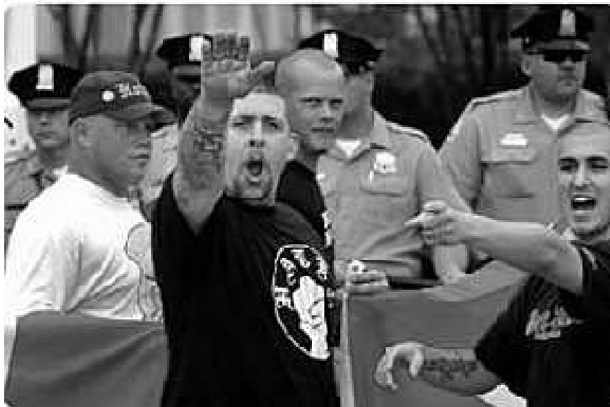
Increasingly bold neo-Nazi movement in Germany

A recent story carried by United Press International begins, “The European Union will break up within 15 years as a result of its countries being dragged down by unsustainable welfare programs, a