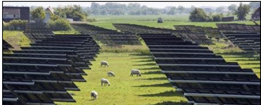
Solar farms "radically uneconomical."

in the following article, reprinted with permission from Speigel Online . See next page. □