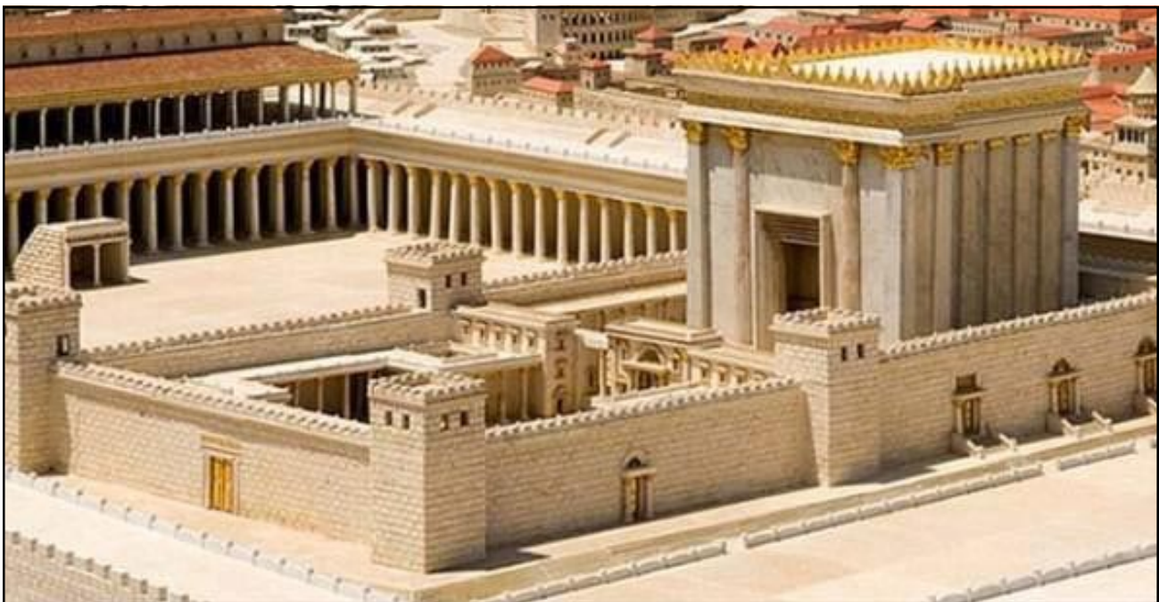
Scale model of Herodian Temple