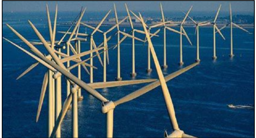
Wind turbines at sea cannot power Europe's cities.

At the request of Commission President José Manuel Barroso, EU member states are no longer to receive specific guidelines for the development of renewable energy. The stated aim of in-