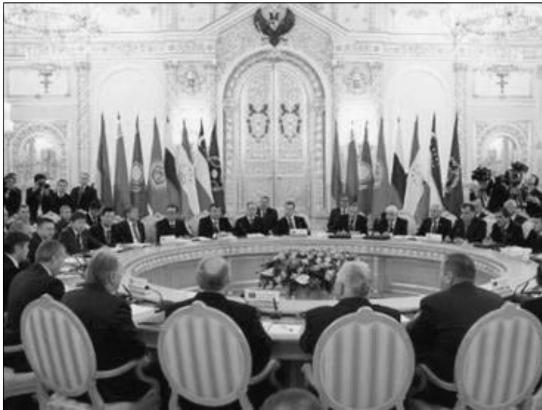
Roundtable meeting of EU.

In the service of their economic interest, they should opt for flexible visa regimes, which will nonetheless allow them to keep control of crime and immigration. We will also have to dissolve the euro to give nation states some monetary breathing space so that they can once again set