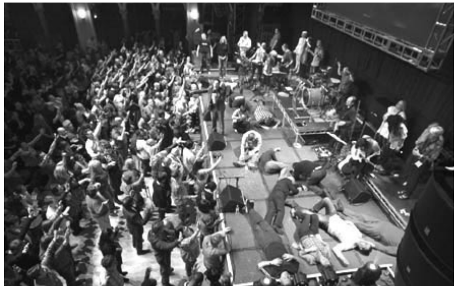
"Faith Healing Revival" (Is there a doctor in the house?!)

A foremost religious leader once said, First, let us understand what Christianity is not . It is not a way of