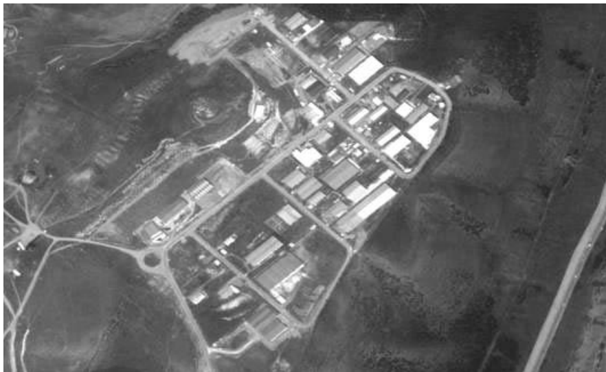
Shahid Bahonar Microbial Plant in Marzanabad—Iran ( DigitalGlobe Image , May 2012)

microbial agents that, if unleashed, could kill millions of people.