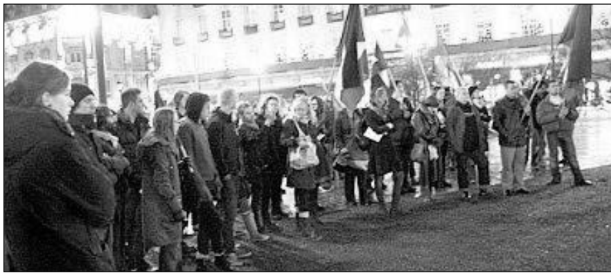
Protest against christian persecution by Islamists.