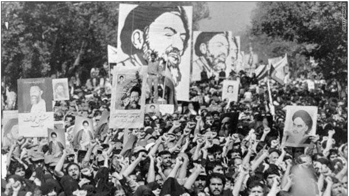
This was 1979, when Carter’s “human rights” policy resulted in “death to America” doctrine