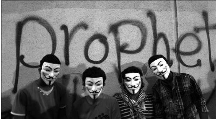
Islamic zealots at U.S. Embassy Cairo - identify themselves with “occupy” movement

ists just taking advantage of the current posture of American weakness, or is something more sinister afoot? In Germany, we’re hearing expressions of concern about U.S. economic prospects, as if they are on a par with the collapse