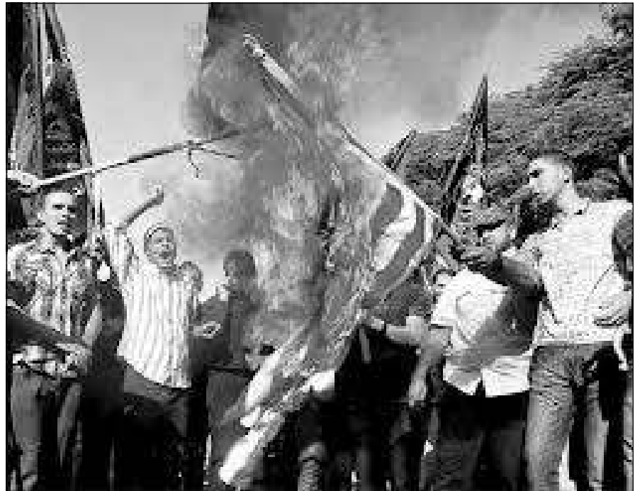
Egypt: Stable ally becomes dangerous enemy

velopment sites and moved most of its centrifuges to hardened facilities deep underground. Experts estimate that Iran might be able to complete an operable weapon within eight to ten weeks. Israel suspects that Iran may already have enough enriched uranium for a nuclear device or two, and with everything going deep underground, the opportunity to knock out their capacity is fleeting.