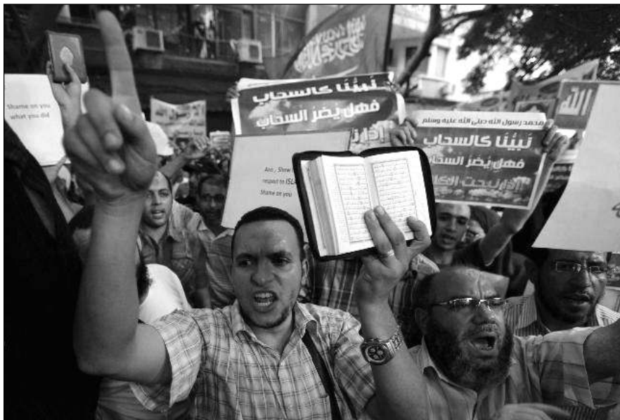
European courts sympathise with “insulted” Muslims

had “paved the way for the Third Reich;” the French National Assembly has envisioned legal action against him.