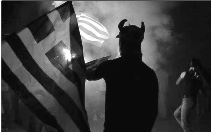
Greece: Protracted economic and political humiliation

cattle shrunk at the withers. The secret of the hypocaust was forgotten, and chilblain-ridden swineherds built sluttish huts in the ruins of the villas, driving their post-holes through the mosaics. In