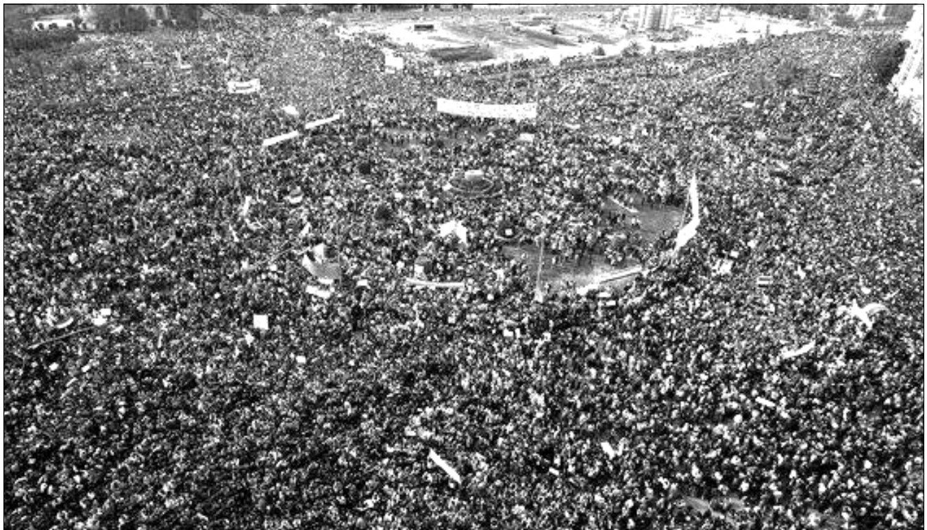
Now "Social Justice" foreign policy has emboldened anti-west zealots in Egypt