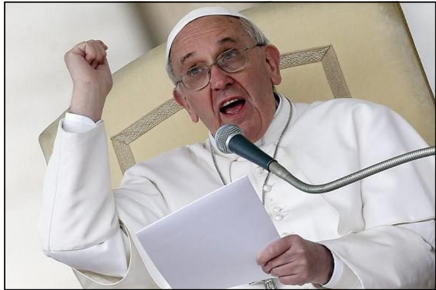
Pope Francis: Curiously critical of money

But the most concerning aspect of his overall theme is his obses-