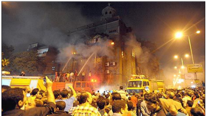
Muslim Brotherhood responsible for burning Coptic and other churches throughout Egypt.

Let's look at some more examples of the mainstream media attempting to keep the public in the dark about important issues. The IRS scandal that targeted religious groups and those that believe in traditional values has been more or less put on the back burner. Participants in the scandal would not cooperate with the House investigation and they are unlikely to do so in the future. They know that they will not get unfavorable coverage from the media and those who investigate them will be accused of political witch hunts.