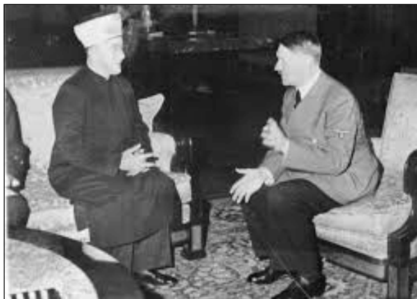
Hitler met with Grand Mufti, shared desire to exterminate Jews.

Hitler and formed an alliance. Hitler supplied funding to the Brotherhood and they supplied troops and much infiltration and information about the Middle East. Muslims comprised the largest of Hitler's Waffen-ss division. Their ultimate goal is to spread strict adherence to Islam among countries of the world and establish a transnational caliphate. The Brotherhood shares many likes and much symbolism with Nazism and has been banned at least twice in Egypt in the 20 th century because of terrorism, murders, bombings, and attempted assassinations of leaders. They are not at all adverse to killing women and children and wish to eradicate the Jews as the Nazi's wished. Our media has ignored this back-