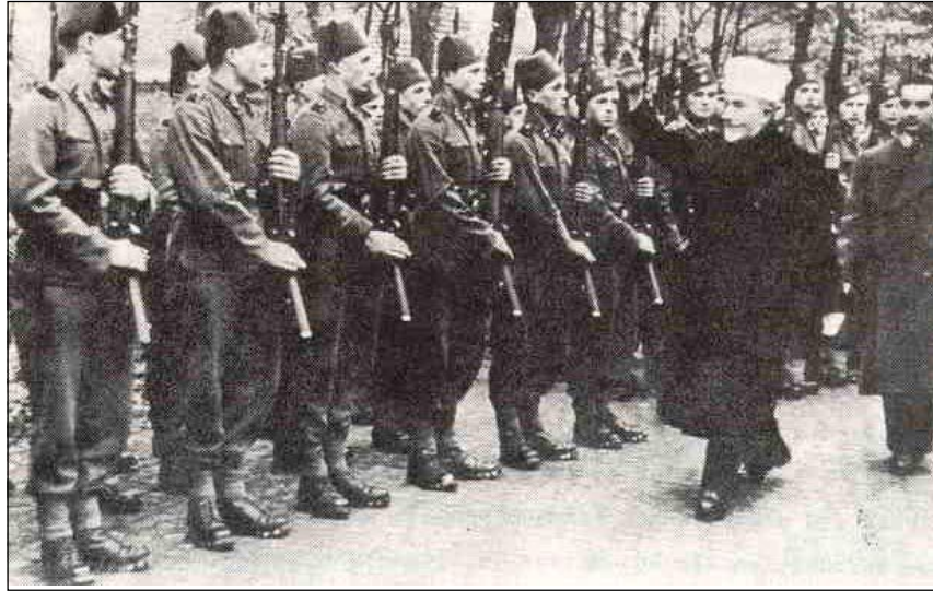
Grand Mufti of Jerusalem salutes Muslim SS Division.

The government and media praised the Arab Spring. It was portrayed as positive and primarily