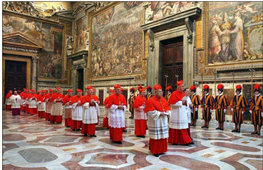
Cardinals proceed to Sistine Chapel to cast votes for prospective pope.

“In any case, from the year 314 onward until the invention