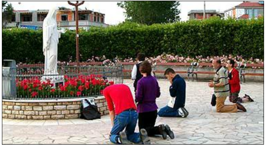
Worshipping before idol of Mary.